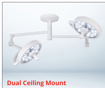
Dual Ceiling Mount